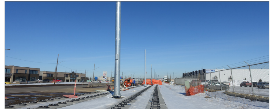
OCS Pole - March 2019