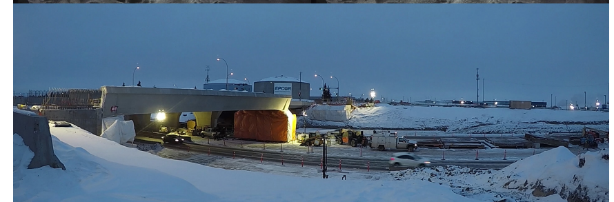
Installation of concrete spans at Whitemud - February, 2019