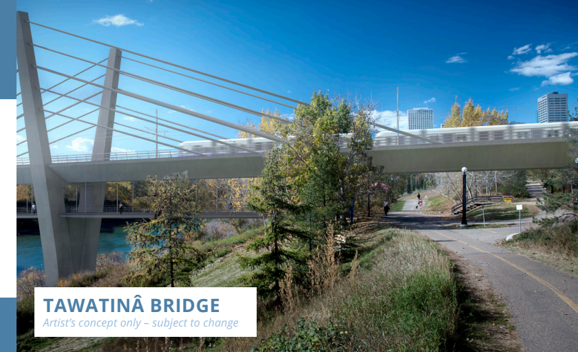
TAWATINÂ BRIDGE Artist's concept only - subject to change

For updates and more info visit transedlrt.ca