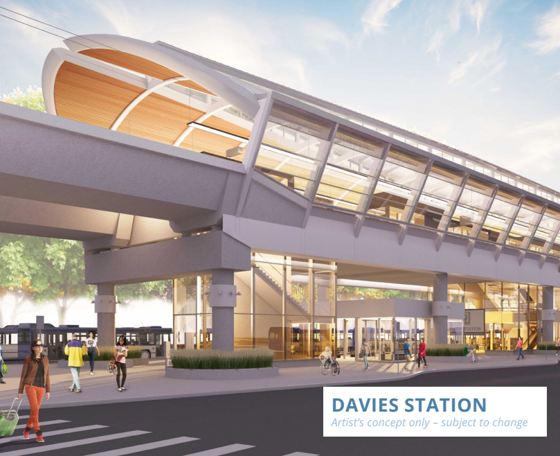
DAVIES STATION Artist's concept only - subject to change