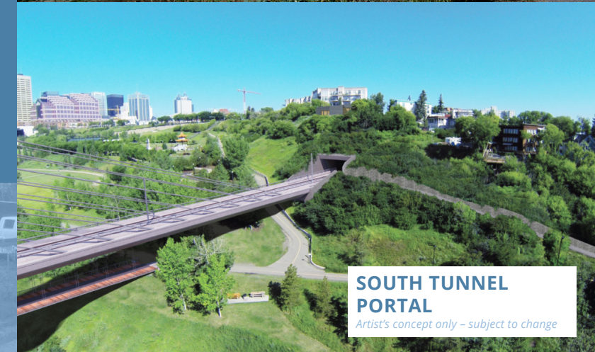
SOUTH TUNNEL PORTAL Artist's concept only - subject to change