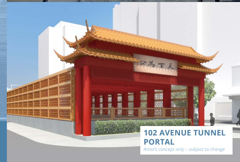
102 AVENUE TUNNEL PORTAL Artist's concept only - subject to change