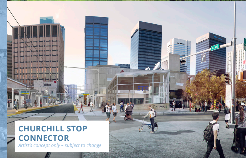
CHURCHILL STOP CONNECTOR Artist's concept only - subject to change